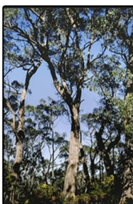
Tree. Grampians, Vic