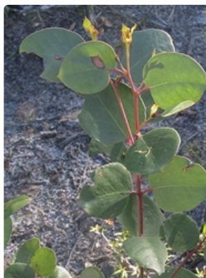
Juvenile growth.