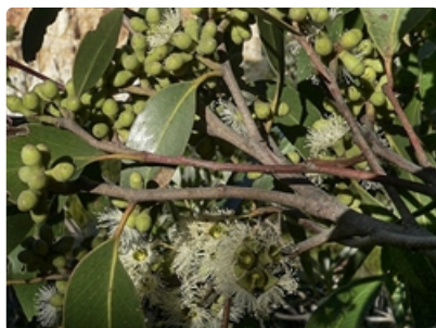
Flowers, buds, and leaves. Photographer Jackie Miles