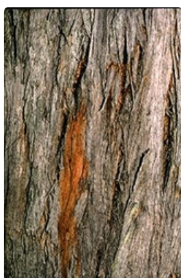
Trunk. Grampians, Vic