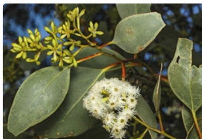
Flowers, buds, and leaves. Australian Plant Image Index, Photographer Murray Fagg, Australian National Botanic Gardens, Canberra, ACT