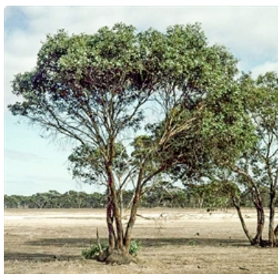
Mallee. north of Port Lincoln, SA