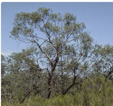
Tree (subsp. camphora ). east of Mt Curran, Qld