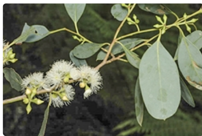
Flowers, buds, and leaves (subsp. camphora ).