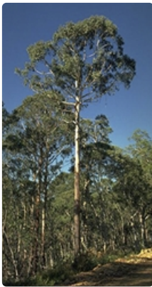
Tree. Corryong to Orreo, Vic