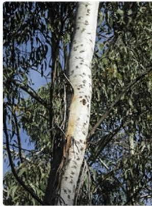
Trunk. Kosciuszko National Park