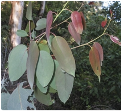
Juvenile foliage. Photographer Jackie Miles, Kosciuszko National Park