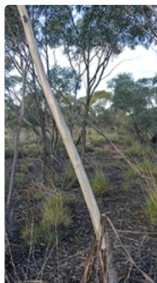
Bark, young mallee. Photographer Don Wood, Scotia Sanctuary, western NSW