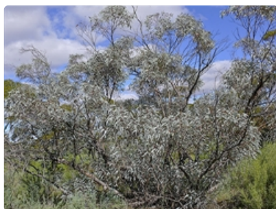
Old mallee. Photographer Don Wood, Scotia Sanctuary, western NSW