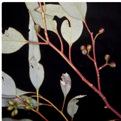
Flower buds, gumnuts, and leaves. Scotia Sanctuary, western NSW