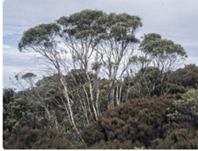
Mallees. Australian Plant Image Index, photographers Brooker & Kleinig, unknown place