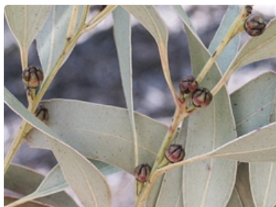
Gumnuts and leaves.