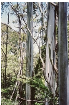
Trunks. New England National Park west of Bellingen