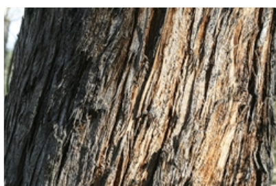
Bark. Photographer Arthur Chapman, Melbourne, Vic