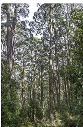
Trees.