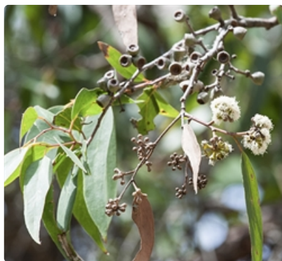
Flowers, buds, gummuts, and leaves. north of Bendigo, Vic