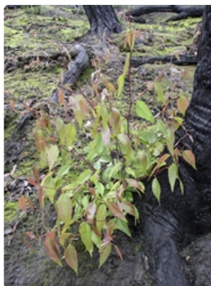
Juvenile regrowth. Macedon Ranges, Vic