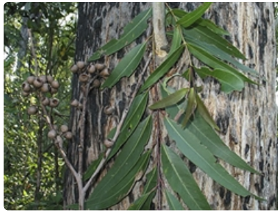
Gumnuts, leaves, and bark.