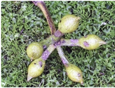
Flower buds. Photographer Peter Woodard, unknown place