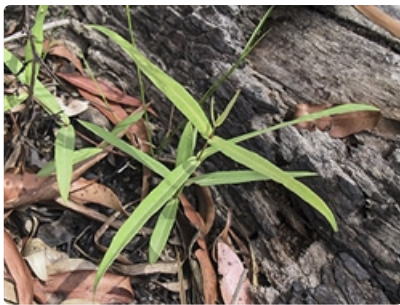
Juvenile foliage.