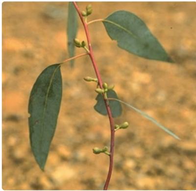
Flower buds on leafy stem. Australian Plant Image Index, photographer Peter Ormay, Canberra, ACT