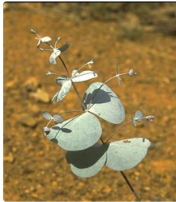
Juvenile leaves.