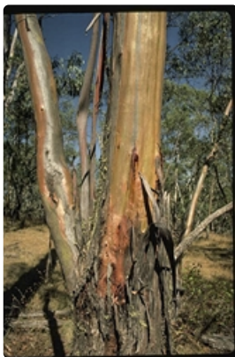
Lower trunks. Corryong to Omeo, Vic