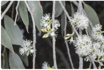
Flowers, buds, and leaves. near Jidabyne