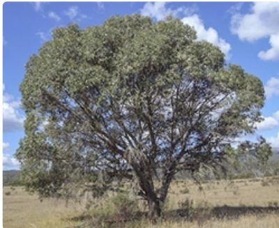
Mallee. Kosciuszko National Park