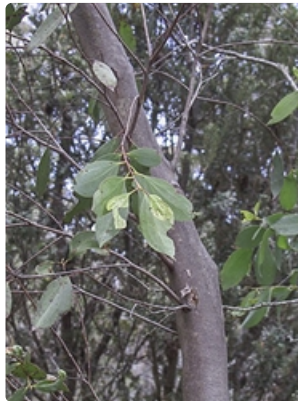
Juvenile foliage and trunk.