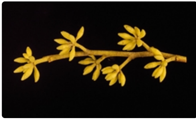
Flower buds on stem