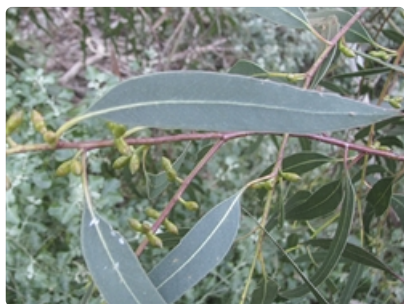
Leaves and flower buds. Werribee Gorge State Park near Bacchus Marsh, Vic