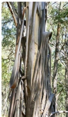
Bark. Macedon Ranges, Vic