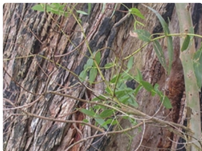
Juvenile foliage and stocking bark.