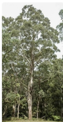
Tree. Tallaganda State Forest east of the ACT