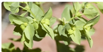
Flowers and leaves. Australian Plant Image Index, photographer Murray Fagg, Mt Stromlo, ACT