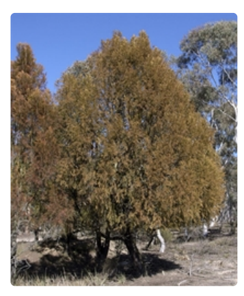
Tree with winter foliage. Australian Plant Image Index, photographer Murray Fagg, Black Mountain, Canberra, ACT