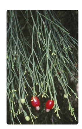
Fruiting stems. Photographer Don Wood, inland from Pambula