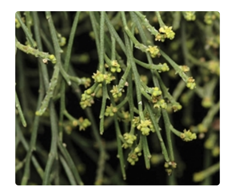
Flow ering stems.