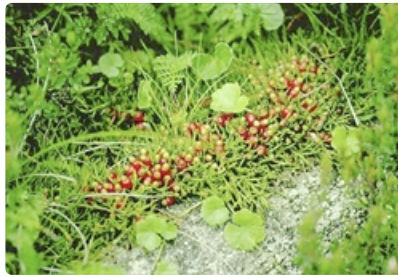
Fruiting plant. Mt St Gwinnear, Vic