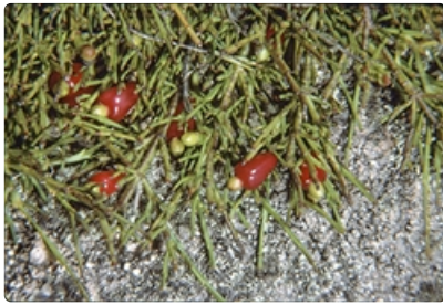
Fruiting branches.