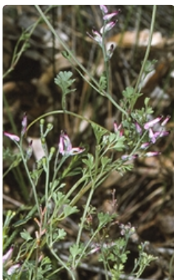
Flowering stems. Photographer Don Wood, east of Bega