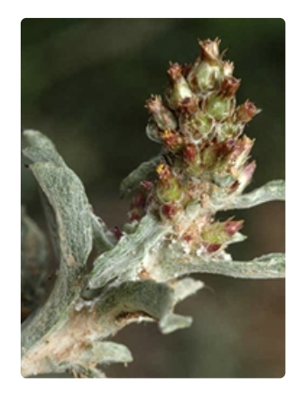
Flower cluster and leaves. Scottsdale Bush Heritage Reserve near Bredbo