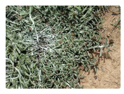
Flowering plants. Australian Flant Image Index, photographer Murray Fagg, Scottsdale Bush Heritage Reserve near Bredbo