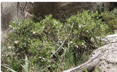
Shrub.