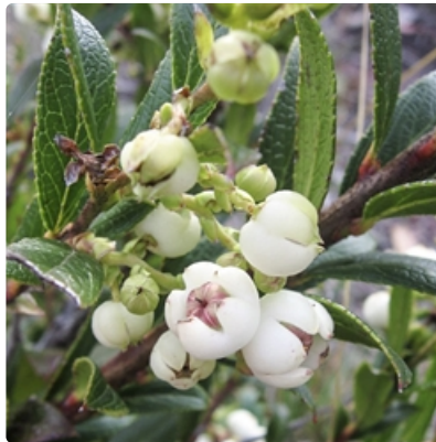
Fruiting branch. Photographer Andre Messina, unknown place, © 2021 Royal Botanic Gardens Board, Melbourne