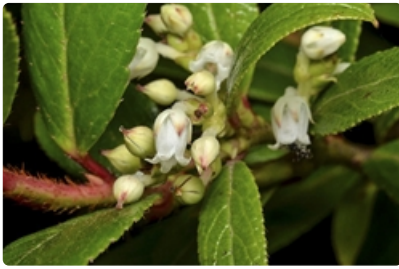
Flowering branch. Barrington Tops National Park