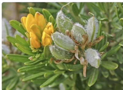
Flowers and pods.