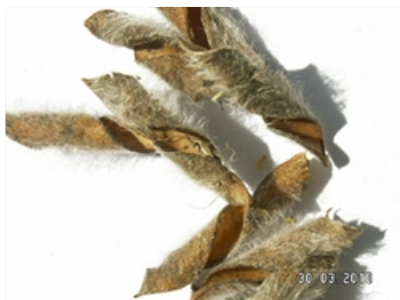
Open pods. near Victor Harbour, SA