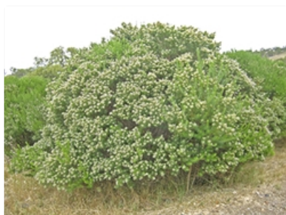
Shrub. Bell Mine, Maldon, Vic