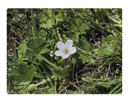
Flower and leaves.