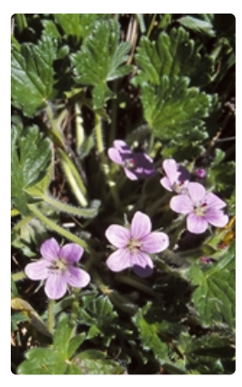
Flowers and leaves. Photographer Don Wood, Namadgi National Park, ACT