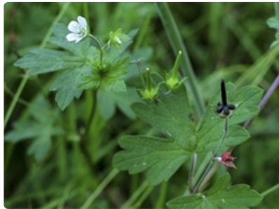
Flower, seed cases, and leaves.