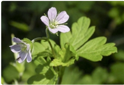
Flower and leaf.