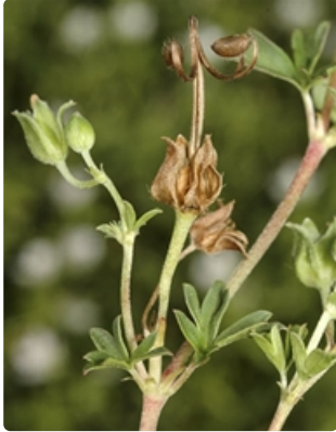
Stems with mature seeds. near Lyndhurst, SA