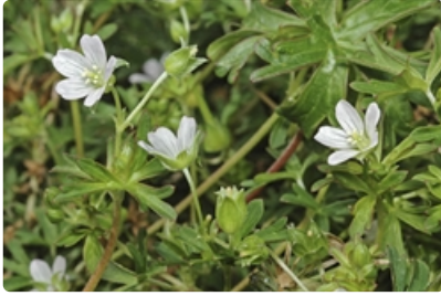
Flowers and leaves. near Lyndhurst, SA