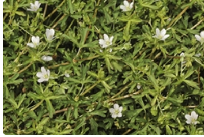
Flowers and leaves. near Lyndhurst, SA