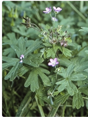
Flowers, leaves, and mature seed (var. solanderi ). Photographer Don Wood, Wonboyn Lake Resort south of Eden