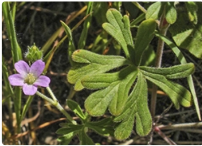
Flower and leaf.