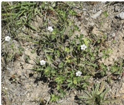
Flowering plant. Scottsdale Bush Heritage Reserve near Bredbo