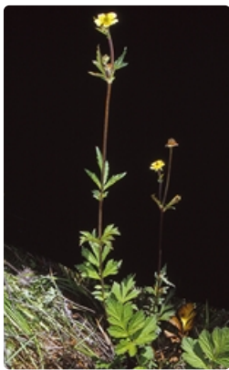
Flowering plants., Namadji National Park, ACT