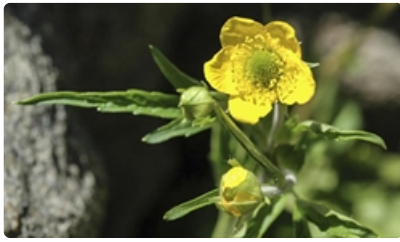
Flower, buds, and leaves.