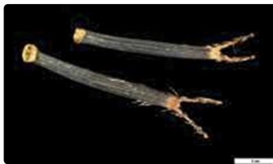
Seeds. Photographer Andre Messina, unknown place, ©2021 Royal Botanic Gardens Board, Melbourne