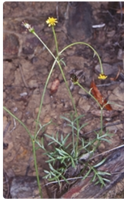
Flowering plant. Wadbilliga National Park