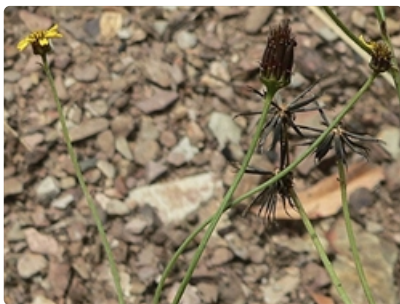
Stems with flower and seeds. Photographer Jackie Mles, Bungonia