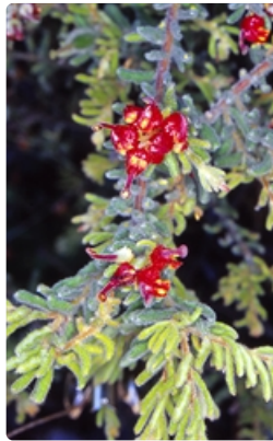
Flowering stems. Aranda Bushland, Canberra, ACT