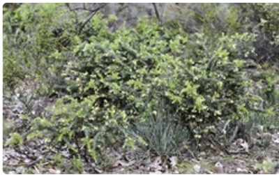
Shrub. Whroo Reserve, Vic