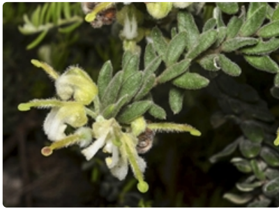
Flowering stem. Australian Plant Image Index, photographer Murray Fagg, Whroo Reserve, Vic