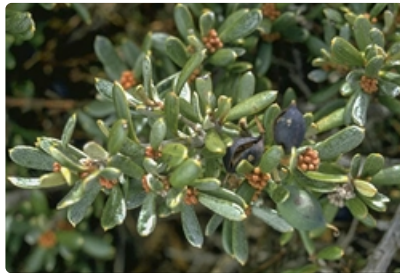
Flower buds, seed case, and leaves. Australian Plant Image Index, photographer Colin Totterdell, Kosciuszko National Park