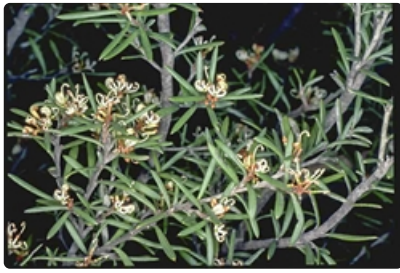
Flowering branches.