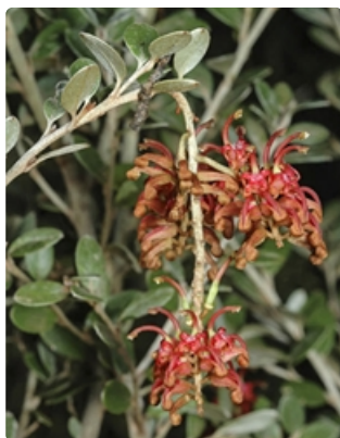
Flower clusters and leafy stems.