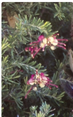
Flowering branches. Namadgi National Park, ACT