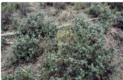
Shrub. near Wee Jasper