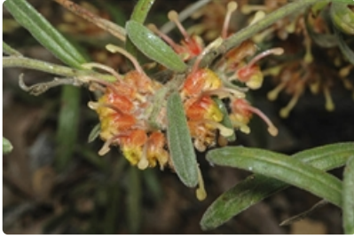
Flower clusters and leaves.