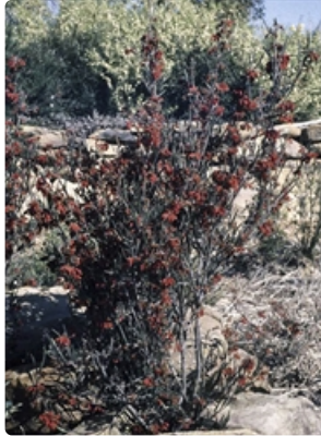
Shrub. unknown place