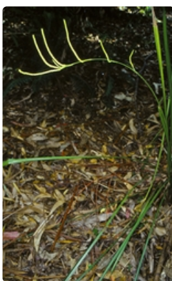
Flowering plant.