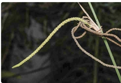
Flower spikes.