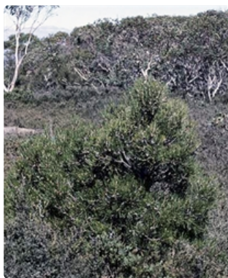
Shrub. Yaouk Peak, just outside SW ACT