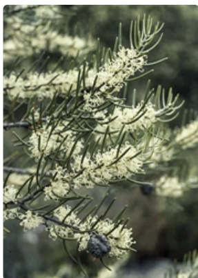
Flowering branches. Australian Plant Image Index, photographer Murray Fagg, Tas