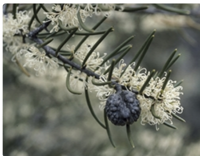
Flowering and fruiting branch.