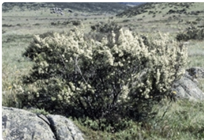
Flowering shrub. Australian Plant Image Index, photographer Murray Fagg, Kosciuszko National Park