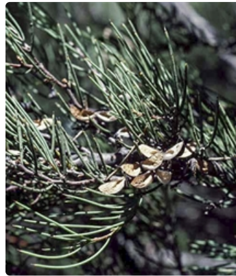
Branches with open 'nuts'.