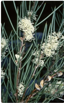
Flowering branches, some with 'nuts'. Photographer Don Wood, SE Forests National Park