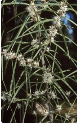
Flowering stems with 'nut'. East Boyd State Forest near Eden