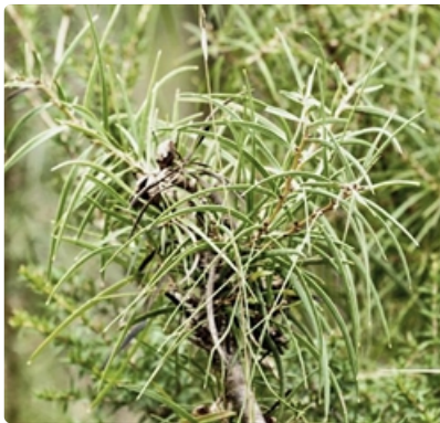
Shrub. Bunyip State Park east of Melbourne, Vic