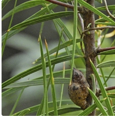
Leafy stem with 'nut'.