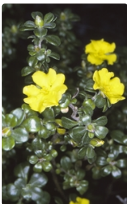
Flowering stems. Booderee National Park, Jervis Bay