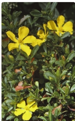
Flowering stems. Eurobodalla Regional Botanic Gardens north of Moruya