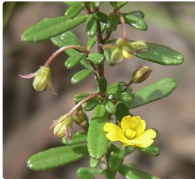
Flowering stem.