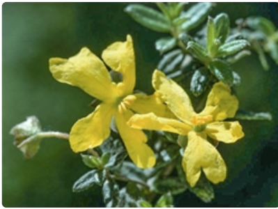
Flowers and leaves.