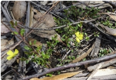
Flowering branches.