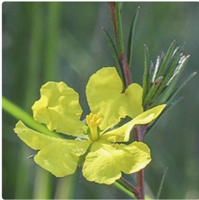
Flower. Photographer Jackie Miles, Mt White N of Sydney