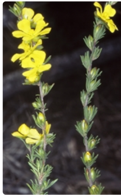
Flowering stems. Sidlings Swamp Flora Reserve south of Eden