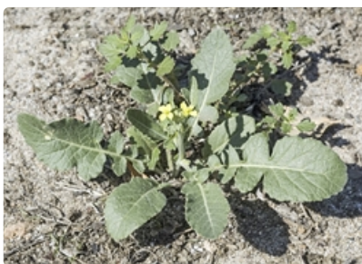
Stunted flowering plant.