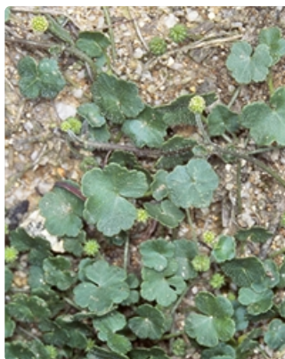
Flower clusters and leaves. Tidbinbilla Nature Reserve, ACT