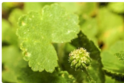
Flower cluster and leaf.