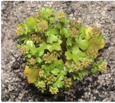
Flowering plant. Grampians National Park, Vic