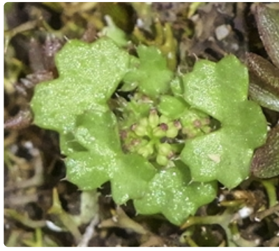
Flowering plant. Photographer Russell Best, Anglesea, Vic