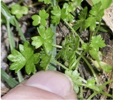
Plant. Macedon Ranges, Vic.