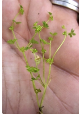
Plant. Illunie south of Cowra