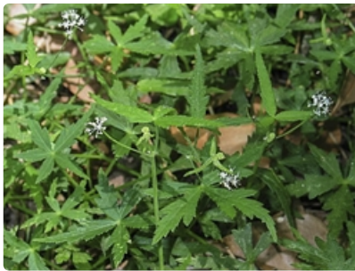
Leaves and flower clusters.