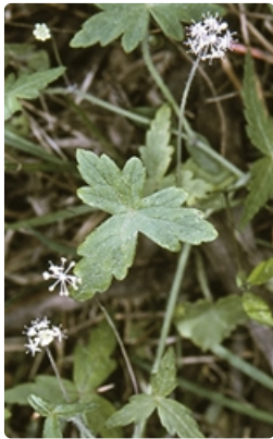
Flower clusters and leaves. Buckenbowra State Forest near Batemans Bay