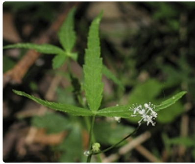
Leaf and flower cluster.