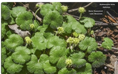
Flower clusters and leaves. Lake Mountain, Vic