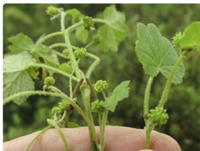
Leaves and flower clusters.