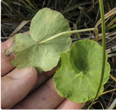
Front and back of leaf. Badja Swamp NE of Cooma