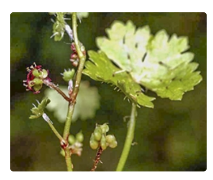
Flowers and leaf.