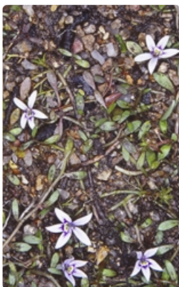
Carpet (subsp. australis ). Wadbilliga National Park