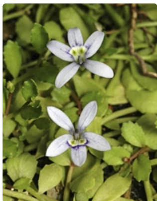
Flowers and leaves. Australian Plant Image Index, photographer Murray Fagg, Australian National Botanic Gardens, Canberra, ACT