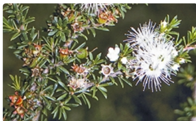
Flowers, spent flowers, and leaves. Booderee National Park, Jervis Bay Territory