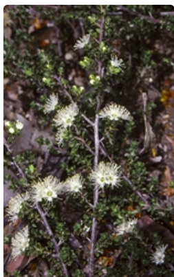
Flowering branch. summit of Big Badja, ENE of Cooma