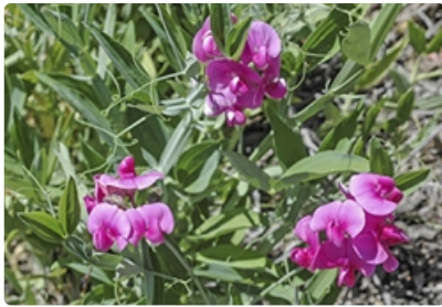
Flowers and leaves. Australian Plant Image Index, photographer Murray Fagg, Stirling Park, Yarralumla, Canberra