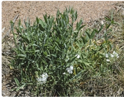
Plant. Australian Plant Image Index, photographer Murray Fagg, Stirling Park, Yarralumla, Canberra